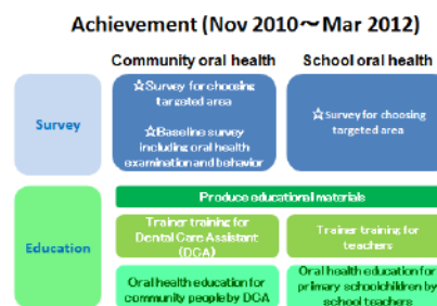
Fig.2: Achievement of OISDE since Nov 2010 to Mar 2012.